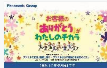
Fiscal 2023 Customer Month poster